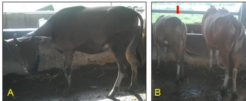
Figure 2. The inbred Bali cow ID: 0991 (A) had small body size (red arrow) compared with the other adult cow (B)