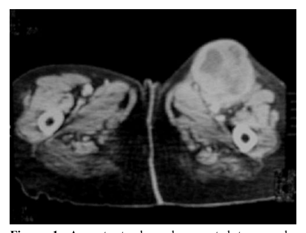
Figure 1. A contrast-enhanced computed tomography scan showing a 12x9x10 cm sized, well-demarcated mass with in heterogeneous significant enhancement and central necrosis originating in the left groin.

The postoperative period was uneventful. She was discharged on postoperative fourth day. Ten days later, the patient was send to a radiotherapy department. We routinely used CT for every 3 months. There has been no recurrence or metastasis during the eighteen months on the follow-up period.