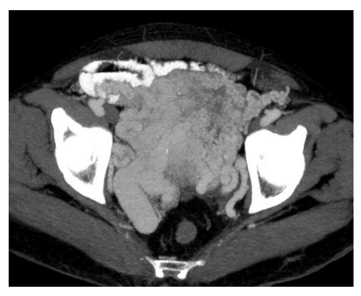
Figure 1. Intravenous contrast enhanced axial MDCT image shows an extensive uterine AVM almost completely invading the uterus.

AVM. Intravenous contrast enhanced MDCT confirmed this diagnosis, namely the uterine AVM (Figure 1). The arterial feeders of the AVM were the bilateral uterine, gonadal and the inferior epigastric arteries (Figure 2).