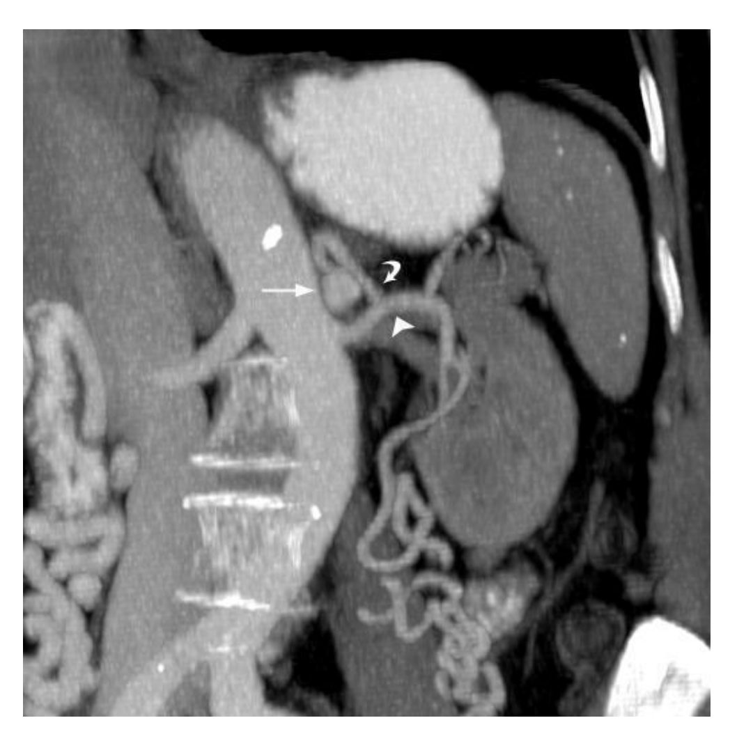
Figure 3. Oblique coronal reformatted image depicts the origin of the left gonadal artery (curved white arrow) from superior aspect of the renal artery (white arrowhead). Note the aneurysm (long white arrow) on the left gonadal artery.

Ruptured gonadal artery aneurysm is a rare cause of spontaneous retroperitoneal hematoma. In the literature gonadal artery aneurysms were presented as case reports in which all the aneurysms were ruptured and related to pregnancy (8-16). To the best of our knowledge, no case of unruptured gonadal artery aneurysm has been reported. We incidentally detected an unruptured aneurysm formation on the dilated gonadal artery in our case unrelated to pregnancy. Several mechanisms have been implicated in the formation of gonadal artery aneurysm during pregnancy.