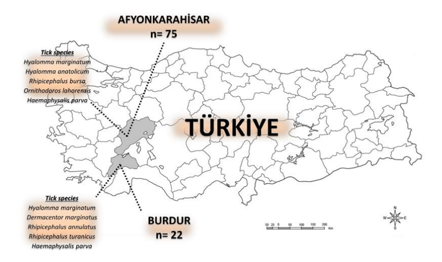
Figure 1: Distribution of the samples according to the provinces from which they were obtained and some tick species reported to be present in these provinces

less than or equal to 30% were defined as negative, whereas those greater than 30% were regarded as positive. The detection of CCHFV-specific antibodies in collected serum samples was recorded.