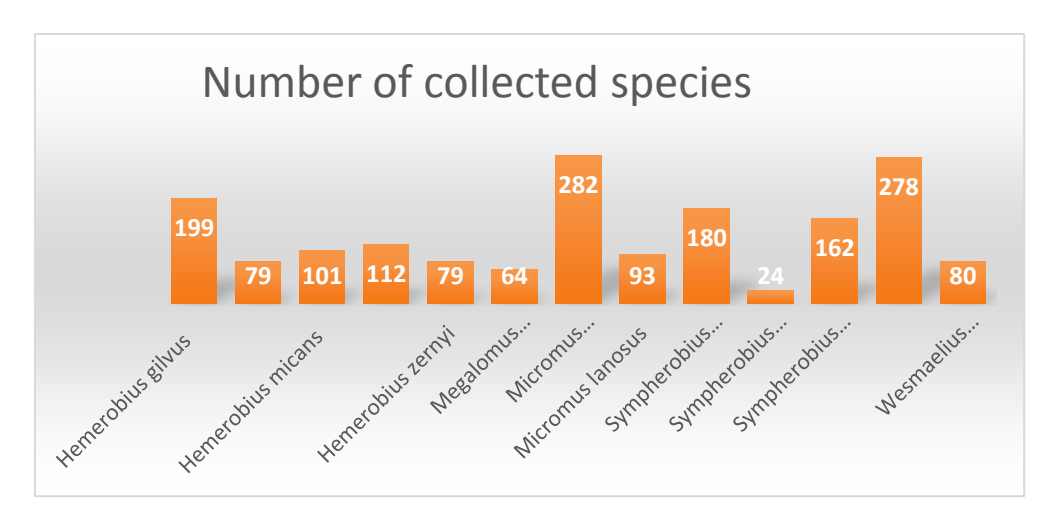
Table 2. Seasonal and habitat preferences of Hemerobiidae of the Osmaniye Province