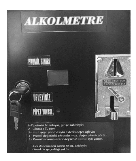
Figure 3. Alcoholmeter

Design and production of the alcohol meter is shown in Figure 3. Measurements were made for alcohol test. As a result of the measurements performed, the correct and successful result values were seen on the LCD screen