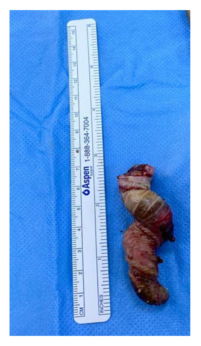
Figure 3. Postoperative removed the necrotic phallus