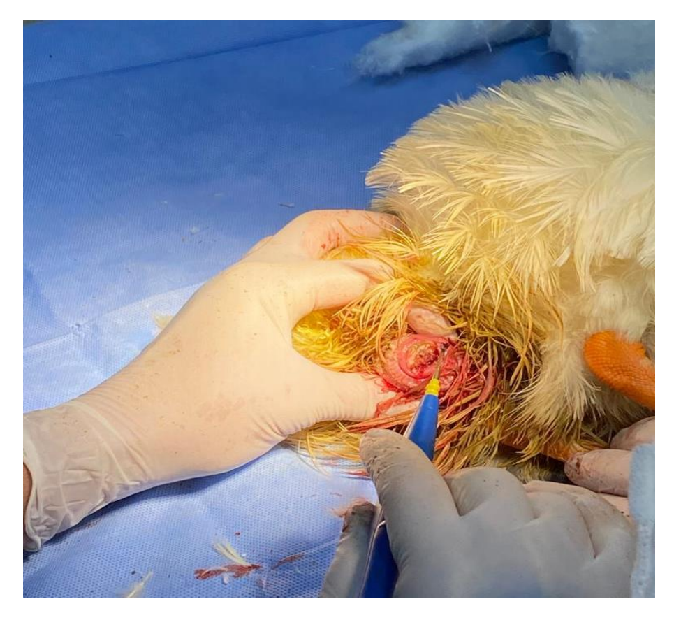
Figure 2. The amputation process was performed with an electrosurgical monopolar cautery pen