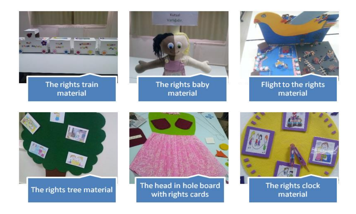
Figure 2. Examples of the Materials Developed for CRE

In the study, data were collected before and after the practice to determine whether the CREC had any effect on the development of the material developing skill of PPTs for CRE. The results showed that none of the PPTs had the material developing skill for CRE before the CREC. With regard to this, PPTs stated that they did not have the required competence to develop materials for CRE before the CREC. The materials developed by PPTs to determine the development of the material designing skill for CRE after the practice and the reports on the materials (MDSAFs) were examined. In this process, the materials developed were scored according to the MAR. Based on these scores, the material designing skills of PPTs for CRE were determined. Accordingly, it was determined that 7 of the PPTs had the skill at a very good level, 12 at a good level, 8 at a medium level, 9 at a level of needs improvement, and 6 had the skill at a weak level. Again, as a result of these investigations, it was determined that 27 of the materials developed could be used for CRE in the pre-school period. The examples of the materials developed are presented in Figure 2.