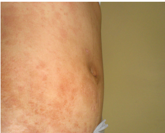
Figure 1: Purpuric skin lesions and pruritus

The patient was 30 years old, gravida 1, parity 1. MF was diagnosed two years ago from pregnancy (first occurred at the age of 27). The patient applied to the dermatology clinic with purpuric skin lesions and pruritus, a history of itchiness and redness of the entire body spreading from legs, in the the dermatological examination, trunk, arms, legs and feet of different sizes, some red, some brown petechiae macular lesions were found (Figure 1). Routine laboratory tests were normal. After biopsies of existing lesions, superficial perivascular lymphocytic infiltration and minimal egzocytosis were identified (Figure 2). Two months later, biopsy was repeated and the same results were obtained.