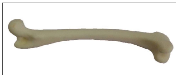
Figure 3 The dog femur produced with using stereolithography method.

In SLA method, UV rays are used on photo polymer liquid for the formation of the structure. The procedure is done layer by layer. In these methods, the surface of a model forms a wavy surface therefore the smoothness and the accuracy of the model