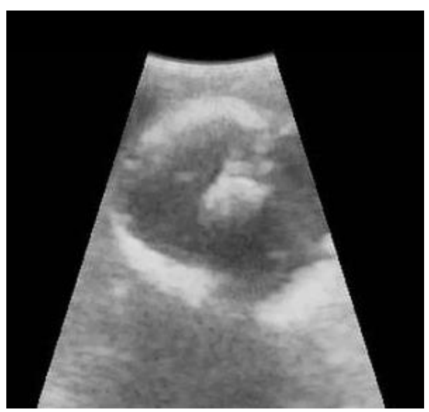
Figure 1. Ultrasonography appearance of hyperechoic sludge in the lumen.

cells were occasionally stained with sitokeratin positively and with ki-67 negatively.